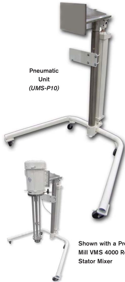
Pneumatic Unit (UMS-P10)